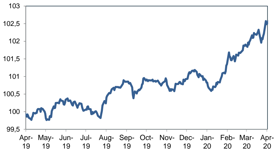
Figure 1. Outperformance of MSCI ACWI ESG Leaders Index versus MSCI ACWI